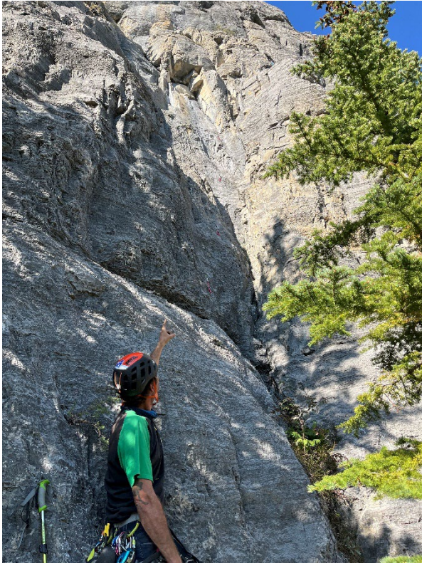
Start of pitch 1